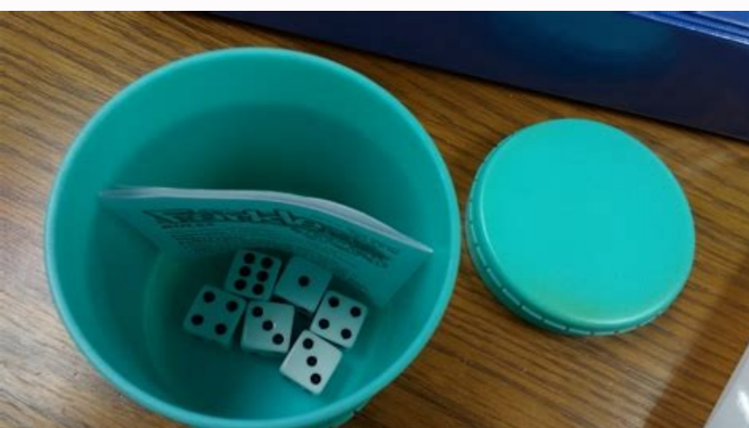
Official printable farkle rules.